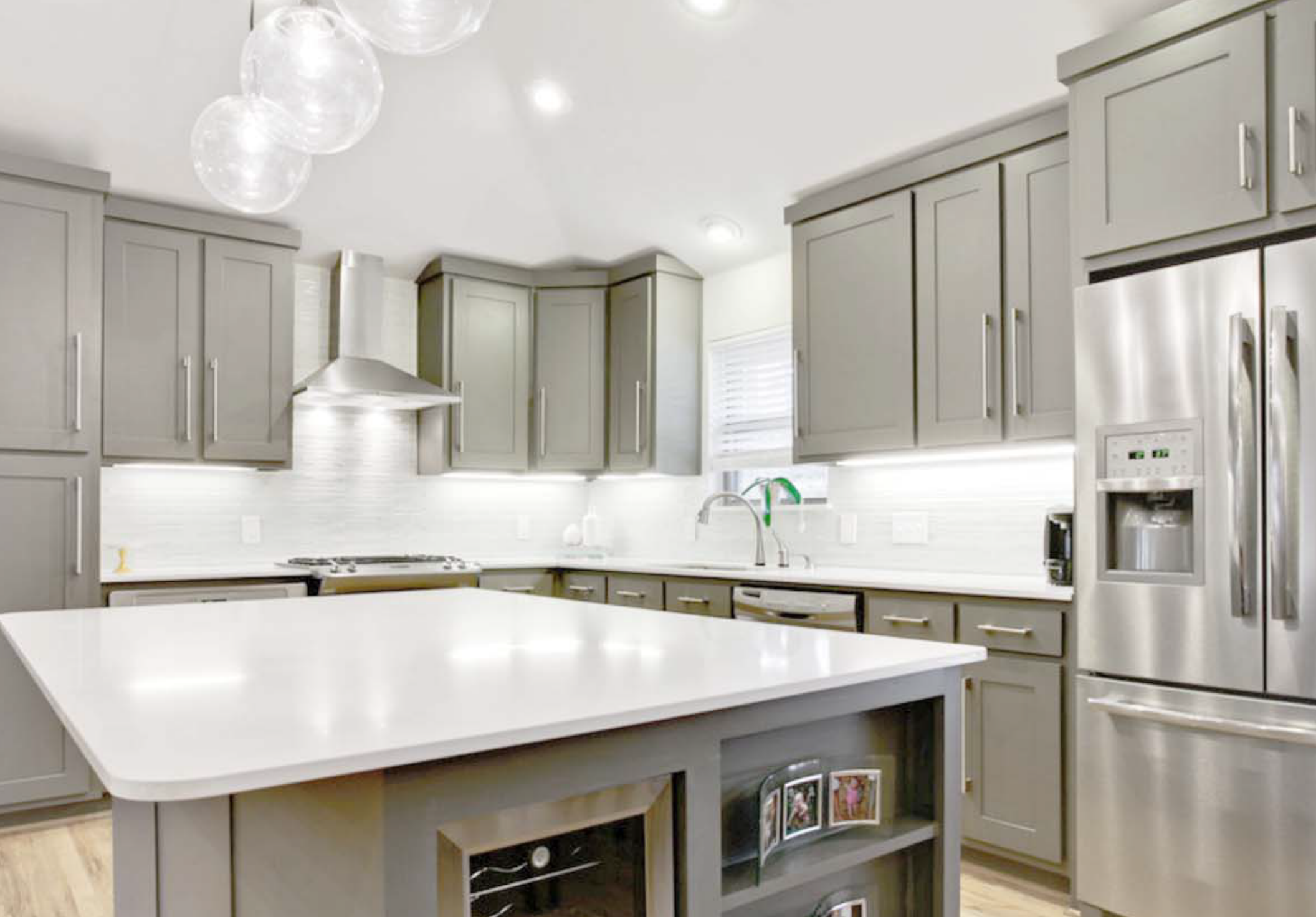
LIGHT GREY SHAKER